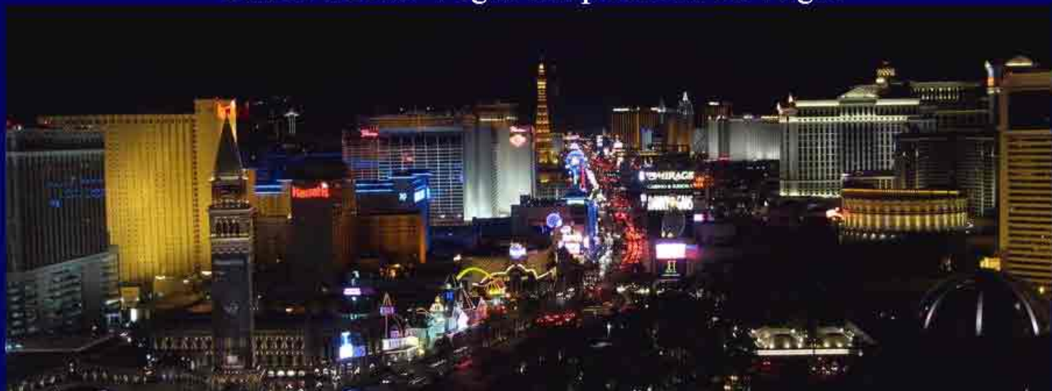
Las Vegas Strip Hotels At Night