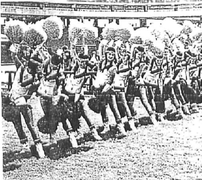
Here are the Redskinettes all decked out in their Indian garb and carrying Burgundy and Gold pom-poms. The girls were THE entertainment hit in their debut last Sunday