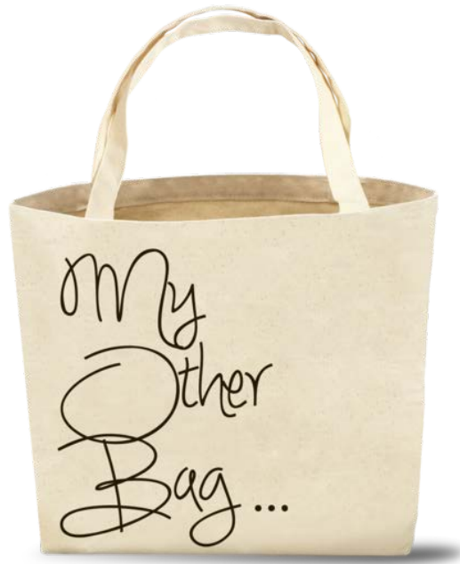
Fig. C. – My Other Bag’s Zoey – Tonal Brown Tote (Front)