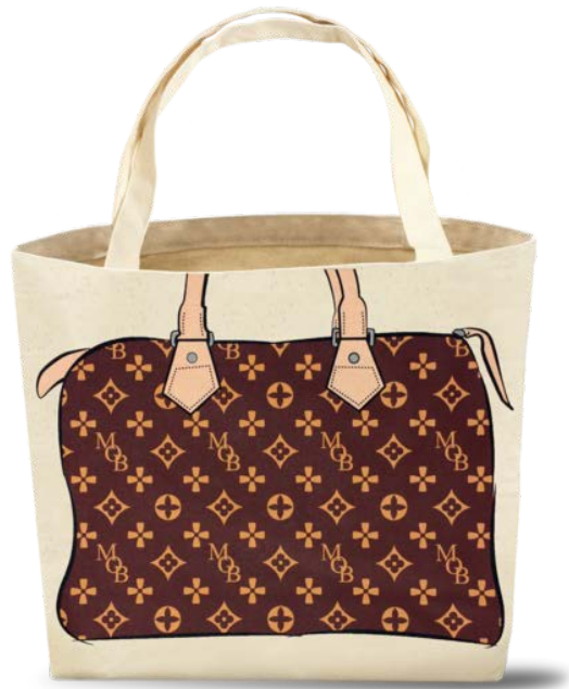
Fig. D – My Other Bag’s Zoey – Tonal Brown Tote (Back)