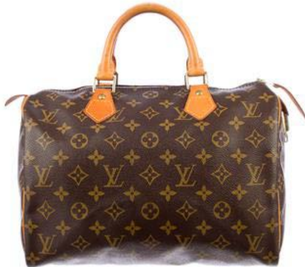
Fig. B. – Louis Vuitton SPEEDY® Toile Monogram